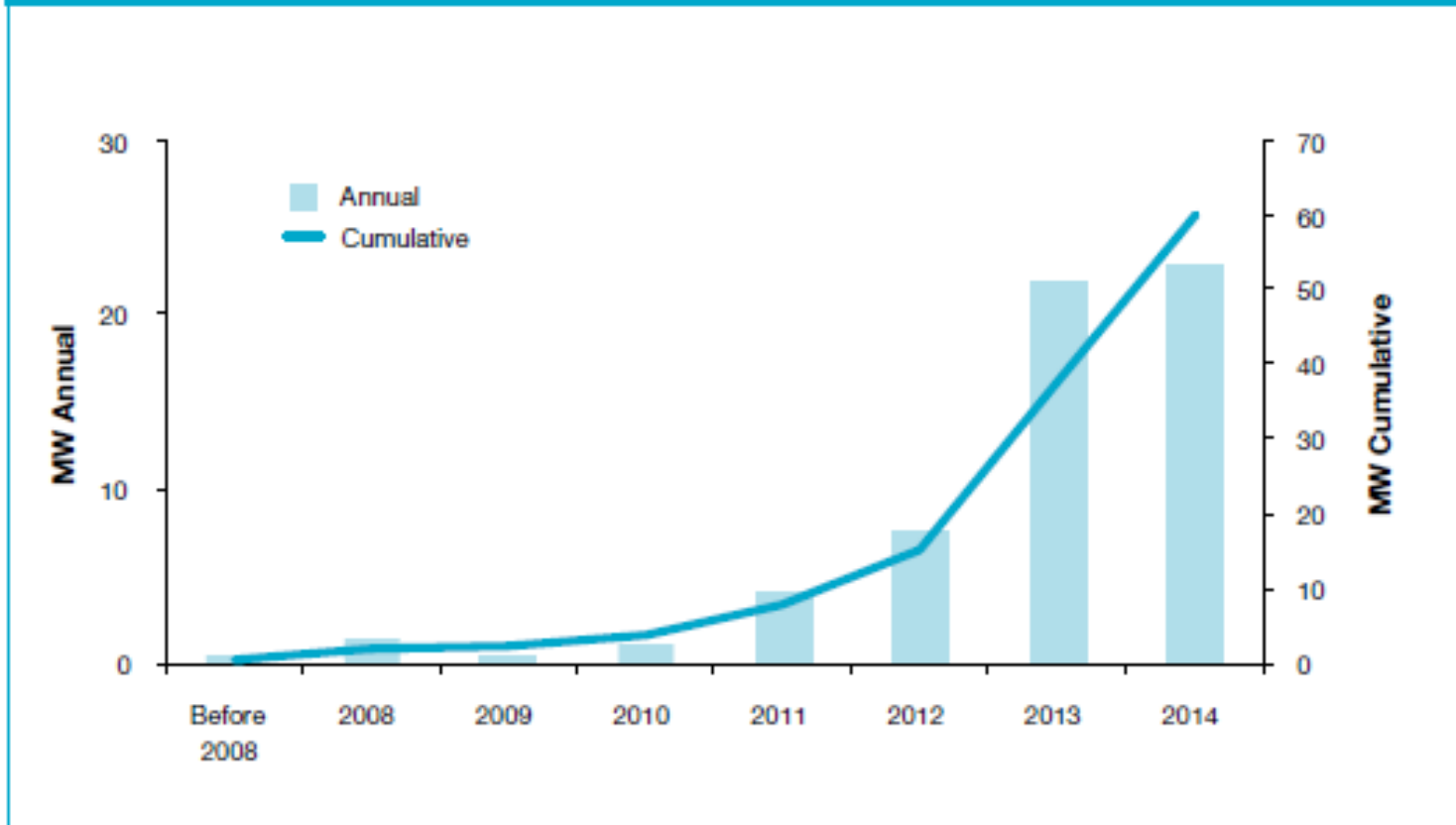
Figure 1: Installed and predicted, Cumulative and Annual Marine Energy Capacity 2000-2014